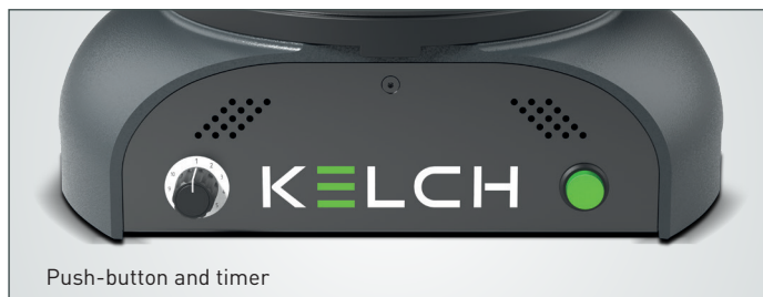
Push-button and timer