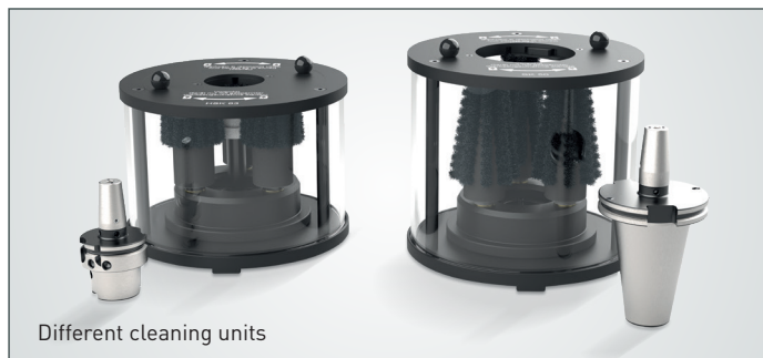
Different cleaning units